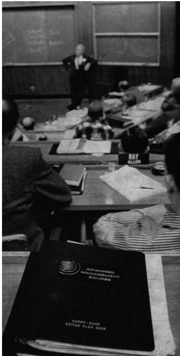
Fig. 1 - "The Pit" at GE's Crotonville Campus.

The curriculum was described as “multi-functional,” and courses were taught in an auditorium known as the “Pit” (Figure 1). The multi-week Advanced Management course, which ran from 1956 to 1961, was open to anyone inside or outside the business and from anywhere in the world, though it was not free. The advanced course cost participants on average $15,000 (around $146,000 in 2022 dollars), and it focused on “generic skills” for managers – planning, organizing, integrating, and measuring – and the philosophies and practices of decentralization (General Electric, 1975: 10).